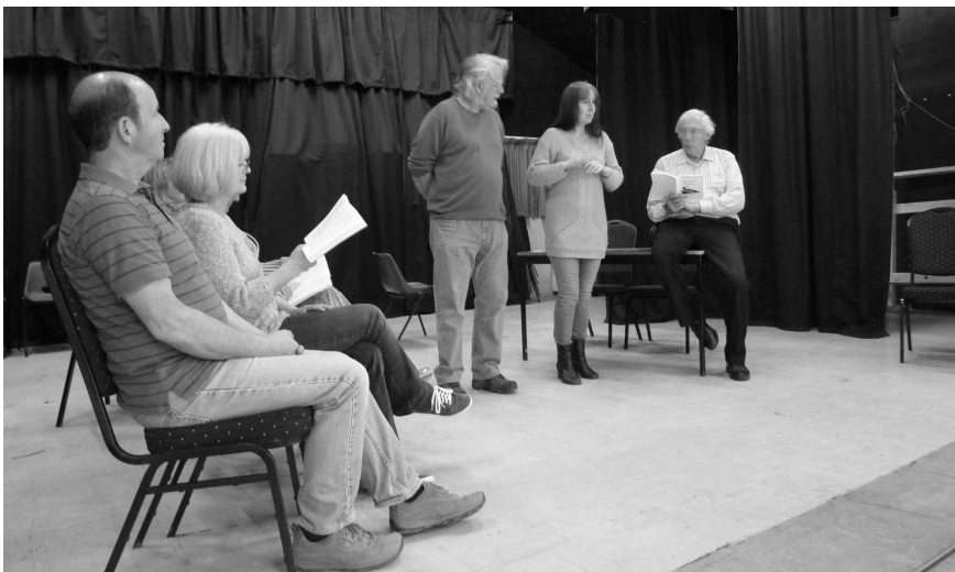
Rehearsal of The Ghost Express .

The village hall in Gweek is being transformed. The clock will be wound back, and when the audience walk through the door, they will find themselves back in 1943. It is an amazing group effort, with the backstage crew working all hours to create the illusion. More information is available online at www.gweekplayers.co.uk .