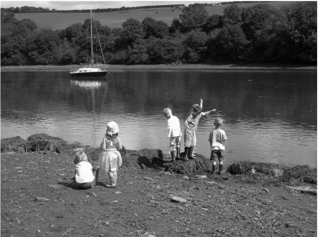
Village children learning about crabs, down on the creek at Scott's Quay.

Goongillings Farm 01326 340630 info@goongillings.co.uk