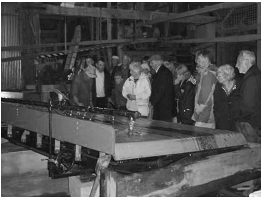
Constantine History Group members learn about the purpose of a shaking table at the King Edward Mine