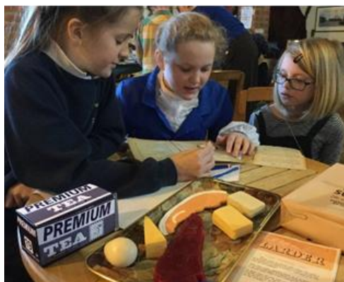
Working out how to manage with rationing