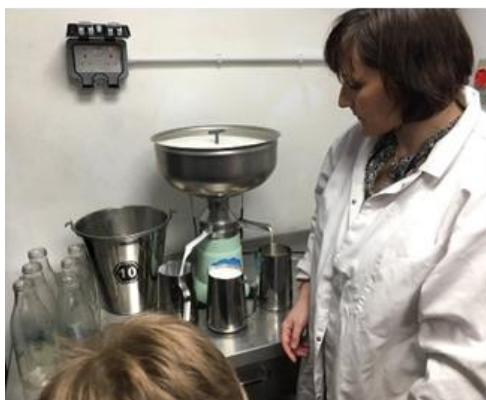
Finding out about milk and cream at Treleague Dairy