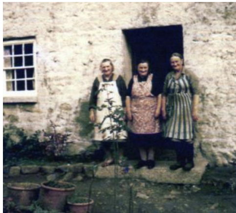
The Tredwen sisters of Comfort Farm, Well Lane

This summer, with your help, we would like to try to undertake a village photo project to recreate an up-to-date set of such photos of Constantine, hopefully with as many of its residents as possible standing outside their homes, providing a permanent record of our village in 2018. An exhibition of the collection may later be staged at the Tolmen Centre.