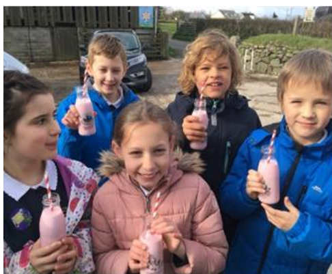
Tasting the end product!

Year 4 were lucky enough to visit Treleague Dairy. Some children were lucky enough to have a go at milking a cow, they also learnt how cream is separated from the milk and the final part of the visit was to taste milk out of a good old fashioned milk bottle!