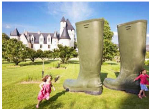
Big wellies at Chateau Rivau

Performance dates: 31st May – 2nd June, 2018 at 6.30 pm.