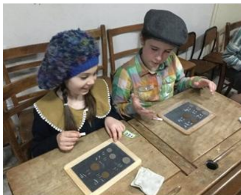
'Evacuees' puzzle over pounds, shillings and pence

Year 5 and 6 dressed up as evacuees and visited Helston Museum and had the opportunity to experience what life was like during the war. There was an opportunity to examine rationing, education and also fathoming out old money!