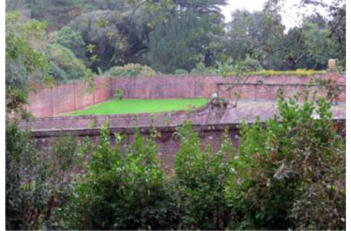
View of the walled garden from the area across the ridge open to visitors

Her talk was about the walled garden, constructed around 1750 along with the house. In 1844 sketches of the garden showed new paths and a greenhouse and by 1880 these had been built. There was a lot of investment and new planting in this era. A photograph, taken in the 1940s, showed the walled garden was still fully productive which was unusual because at that time many of the local estates were not maintained due to conscription of the