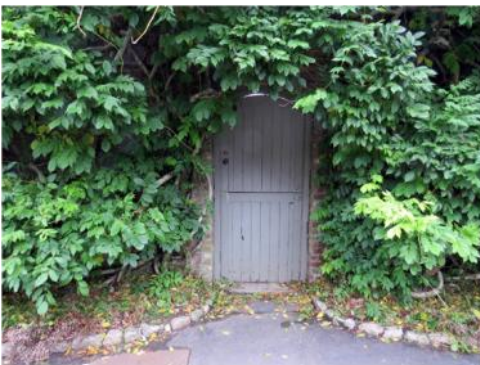
One of the entrances to the walled garden

In recent years, the south vista to the house has been opened to the public, but the walled garden, which has not been used for the last 8 or 9 years, has not been visible or accessible. However, there is now a new plan for this garden and to open it for the public. It is envisaged that a new fruit garden will be created within the walls. The original greenhouse is to be reinstated and all types of fruit planted. A learning centre is to be built using it as a community space for workshops and education. Trials may be carried out comparing old and new varieties and fruit grown may be used for making products locally. After some years of financial difficulties, the National Trust is in a position to renovate the garden and create an interesting area for all to see.